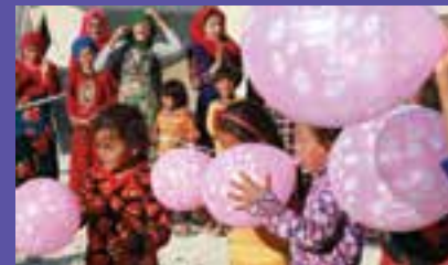
Our Syria field staff organize Eid parties for children in Syria's IDP camps. Lively games and fun sparked joy in an otherwise miserable situation.