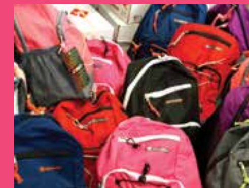
Teacher supply bags are an important part of our annual project. Teachers, especially in high needs parts of the country, have to dig into their own pockets to do their job.