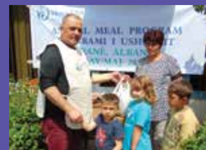
Ramadan food package distribution in Albania, May, 2019