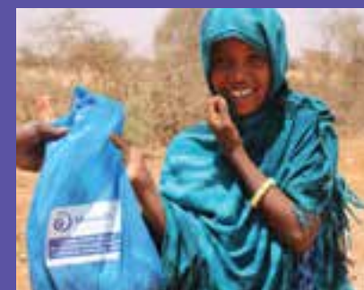
Udhia meat distribution in Somalia, Aug., 2019

Muslims around the world observe two sacred holidays each year. Eid al Fitr marks the end of Ramadan where Muslims fast from before the dawn until sunset for a month. Mercy-USA delivers food baskets or hosts large iftar meals to break the fast around the world for families in need. Fitra food baskets are also distributed at the end of Ramadan.