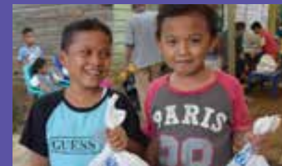
Udhia meat distribution in Indonesia, Aug. 2019