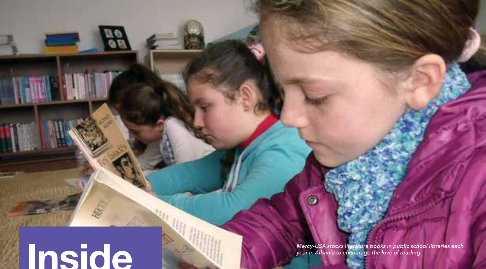
Mercy-USA stocks literature books in public school libraries each year in Albania to encourage the love of reading.