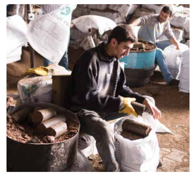
Prina fuel is produced in large logs as seen here, or in small pellets as seen below. The Prina is made at the same plant where extra virgin olive oil is produced making it efficient and better for the environment.

The byproduct of olive oil production—a kind of a mash of skins and pits-has traditionally been put into sludge pits as waste. Because the waste is highly acidic and saline, it can potentially harm the environment, including the groundwater. We visited