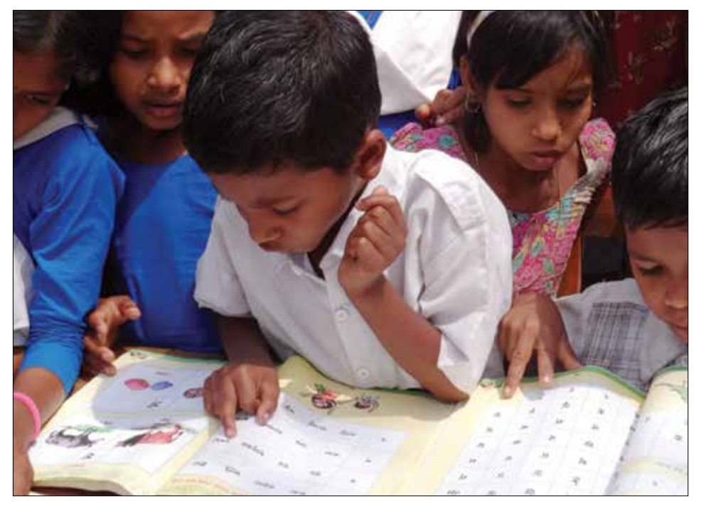
Mercy-USA supports five rural schools in Bangladesh with everything from books, uniforms, teacher salaries