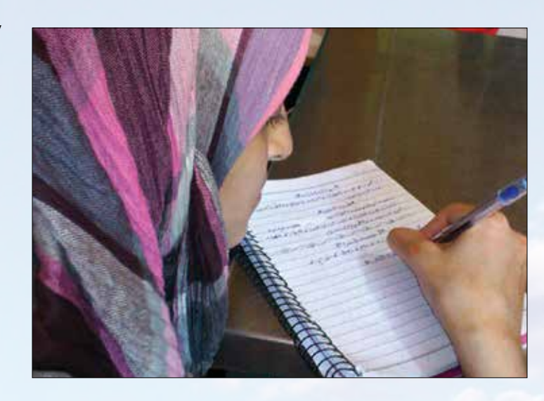
The Gaza Strip Vocational Training for Teens and Young Adults

Hundreds of orphans and other at-risk youth and young adults have successfully graduated from the various courses.