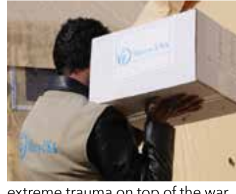
extreme trauma on top of the war trauma they already carry. They feel so alone and abandoned by the world. I'm grateful to be able to do

my job and help my neighbors know they're not forgotten despite this new hardship."